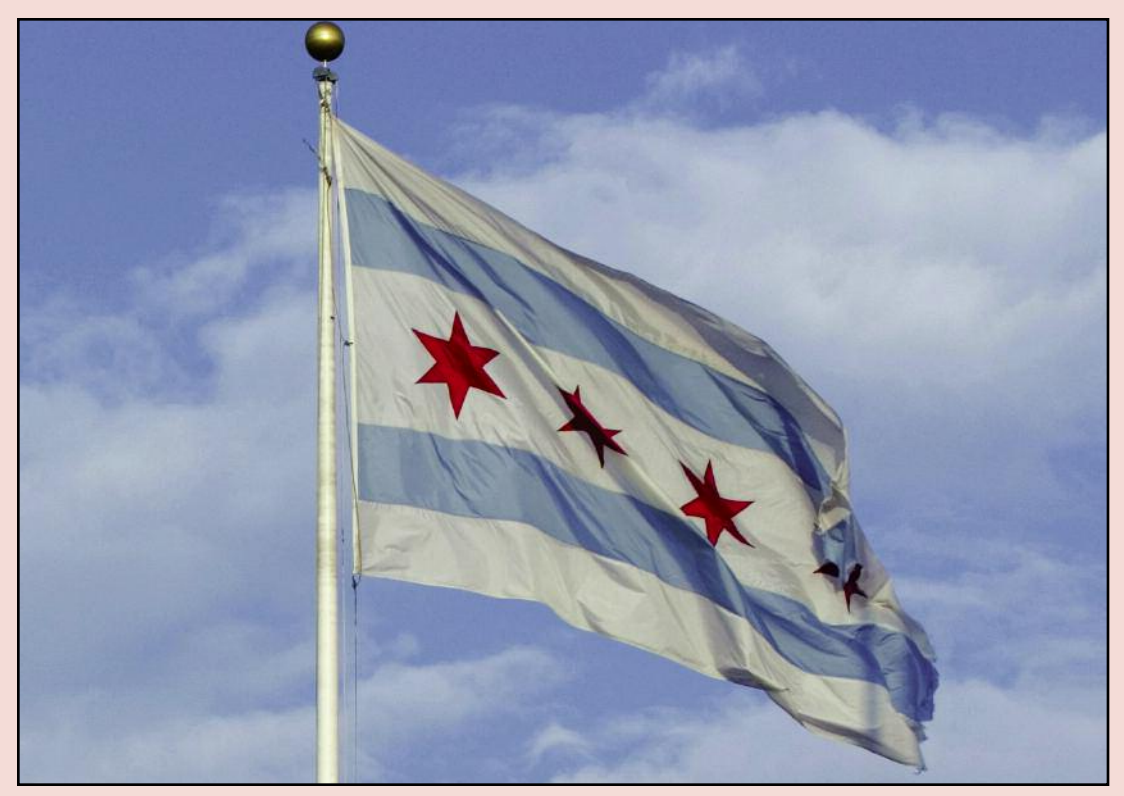
One star on Chicago's official flag stands for the building of Fort Dearborn, the next star stands for the Great Chicago Fire, and the last two stand for the World's Fairs in 1893 and 1933. The top and bottom blue stripes represent Lake Michigan and the Chicago River.

One of the largest fires of the 19th century burned for two days and destroyed four square miles (10 square kilometers) in Chicago. More than 300 people lost their lives, and 100,000 lost their homes.