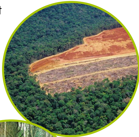
Large, barren tracts of land are all that remain of thousands of acres in the Amazon.

Conservationists estimate that forty to fifty million acres (twenty million hectares) of rainforests are destroyed each year. Logging, mining, farming, and road construction cause most of the damage to this delicate ecosystem . If we humans do not change our practices, rainforests could completely vanish in less than one hundred years.