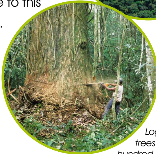
Loggers cut down trees that are over one hundred years old and rarely plant saplings to replace the old trees.

Loggers stack trees that have been cut down and burn them in order to clear land for farming. →