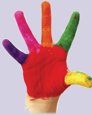
h a n d