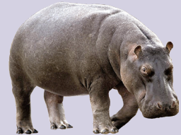
h i p p o