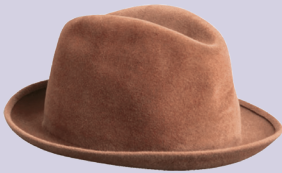
h a t

Say each word. Hear the h sound. Circle each h .