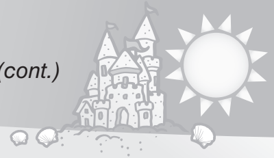
Table of Contents (cont.)