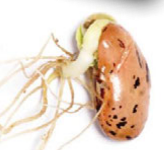
Roots grow bigger.