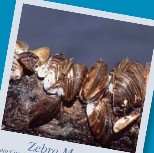
Zebra Mussels