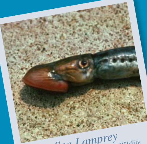
Sea Lamprey

Another invasive species that has entered the Great Lakes and caused problems is the sea lamprey. Originally from the Atlantic Ocean, sea lampreys swam along new canals and passages built for ships to travel around natural barriers, like