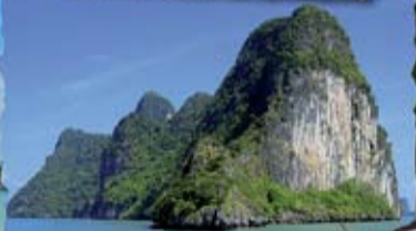
Koh Panak Island