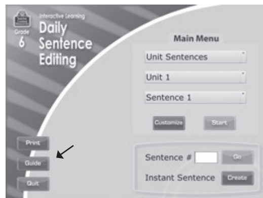
Main Menu Screen

From the Main Menu, you can access all of the features and resources available in the program. To get a detailed explanation of these features, click on the Guide button. This will take you to the Daily Sentence Editing User's Guide.