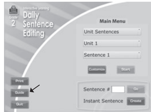
Main Menu Screen

From the Main Menu, you can access all of the features and resources available in the program. To get a detailed explanation of these features, click on the Guide button. This will take you to the Daily Sentence Editing User's Guide.