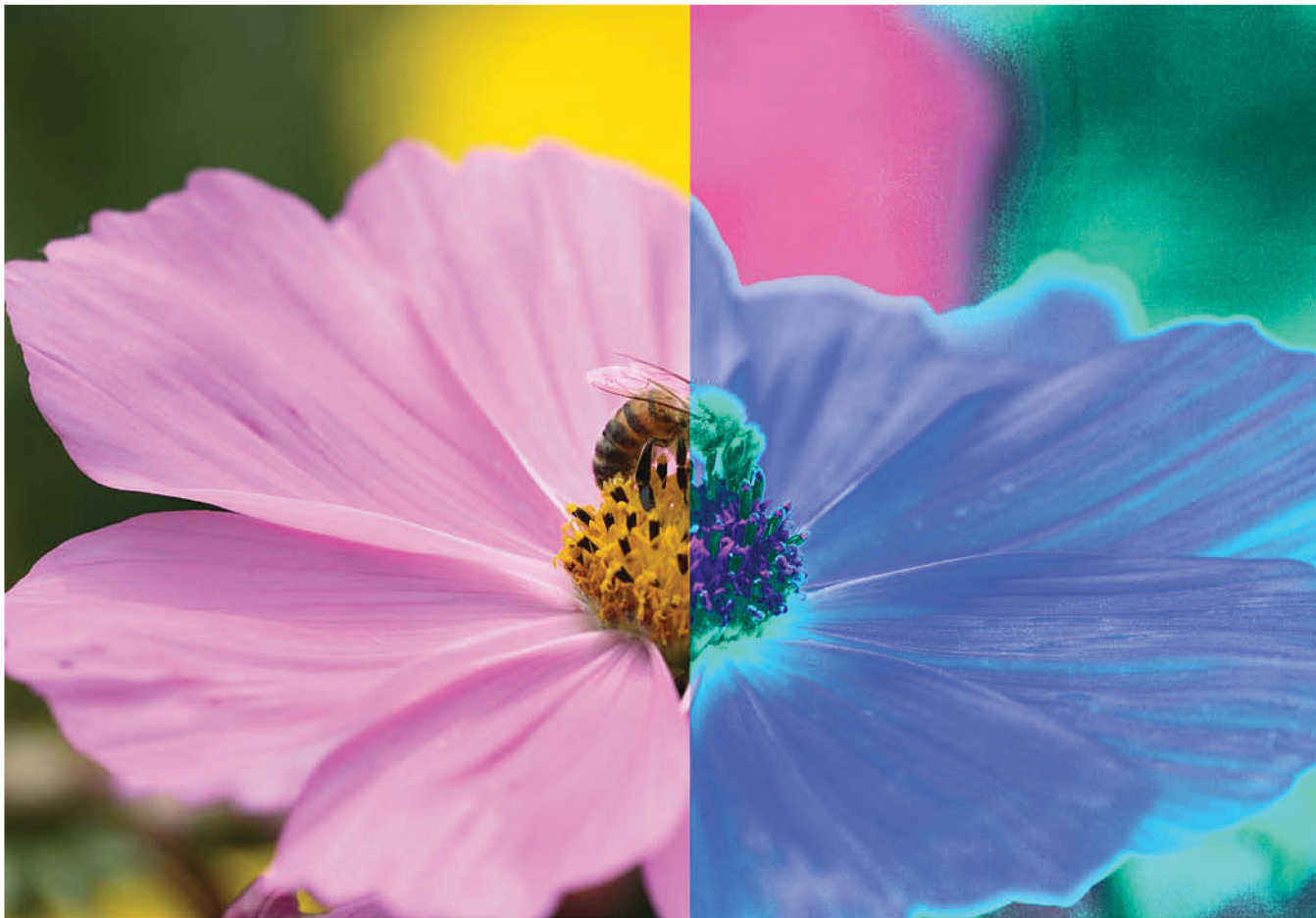
How this flower looks to a human.

Some animals see parts of the spectrum that are invisible to people. People cannot detect high frequency ultraviolet light, but bees can see it. Many flowers that bees pollinate have patterns visible only in ultraviolet light. The photograph below shows how a flower appears to a bee.